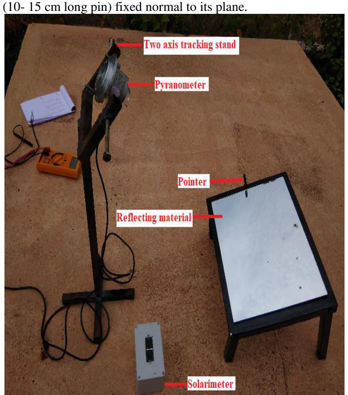
Fig. Experimental setup

radiation which was 50 \times 30 cm. This stand had a pointer